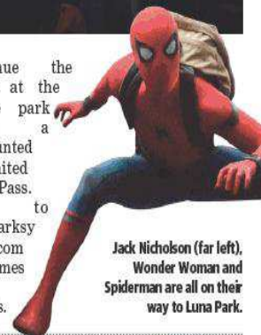
Jack Nicholson (far left), Wonder Woman and Spiderman are all on their way to Luna Park.